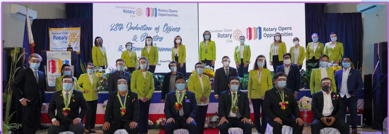
The Downtowners during RCDD's 28th Induction of Officers & Directors & Turnover Ceremony